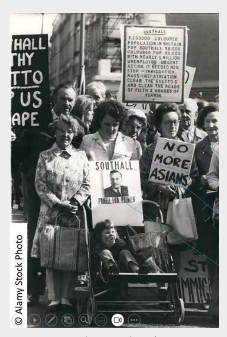
Sep. 09, 1972 – Anti Ugandan Asian March in London

Explain your answer using Source A and your own knowledge. [8 marks]