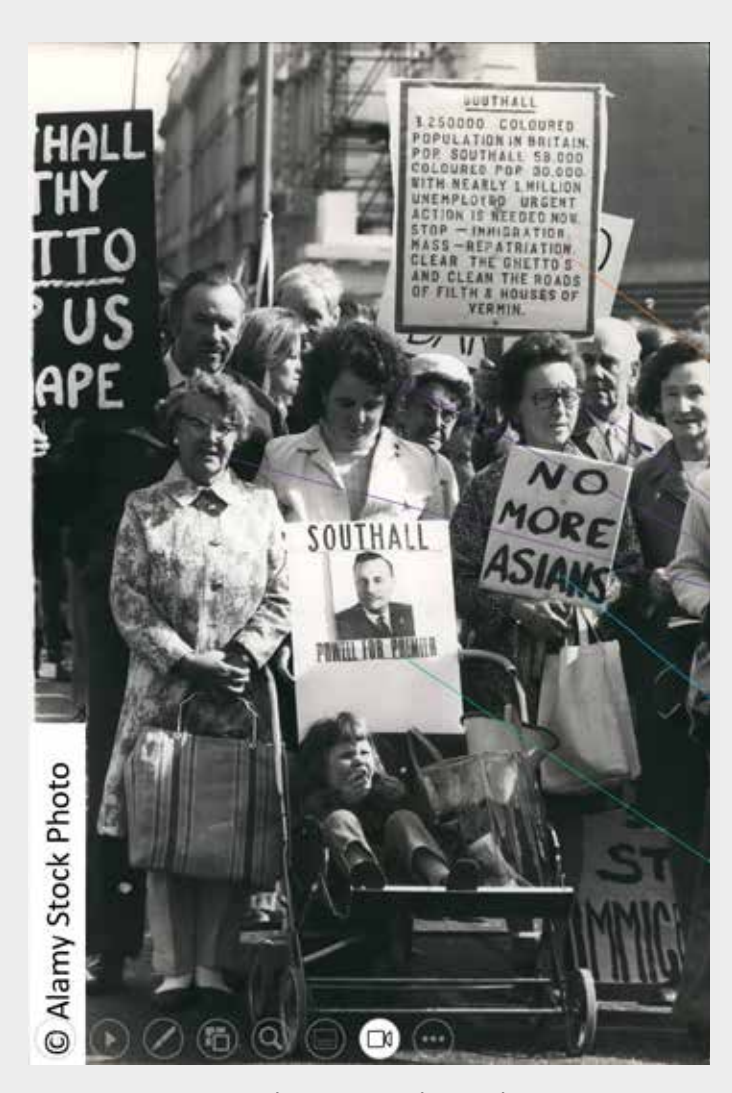
Sep. 09, 1972 – Anti Ugandan Asian March in London

Q1: How useful is Source A to a historian studying the experience of Ugandan Asians migration to Britain?